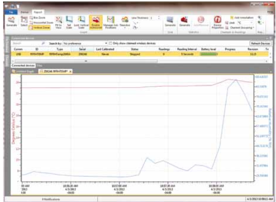
Windows software provides a time-based graph of data

OMEGA's data recorder software is an easy-to-use, Windows-based software package allowing the user to collect, display and analyze data effortlessly. A variety of powerful tools allow the user to examine, export and print professional looking reports with just the click of a mouse. Our cutting-edge software is designed for the continuous monitoring and alarming of all OMEGA's OM-CP Series data loggers and OM-CP-RF Series wireless transmitters. The software can collect and display real-time data from any OM-CP Series logger directly connected to the user's PC, a local area network, or even remotely through the use of OMEGA's OM-CP-RF Series radio frequency transceivers.