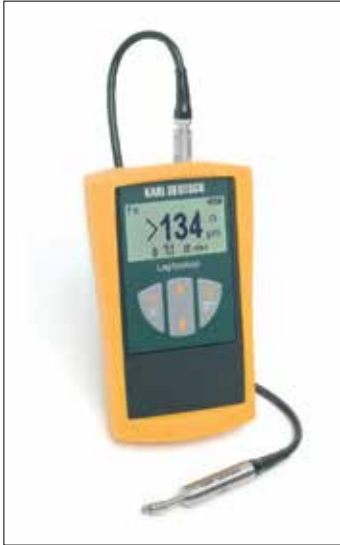
The LEPTOSKOP 2042: high-performance, up-to-date, affordable