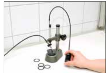
Probe positioning device