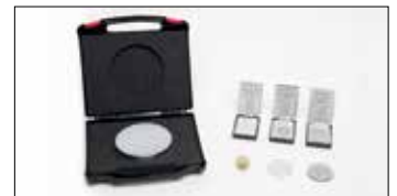
Calibration foil sets and reference blocks