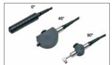
Positioning aid for micro probes