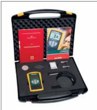
Practical carrying case provides enough space for extensive accessories

The brand name LEPTOSKOP® represents decades of experience in development of precise and reliable coating thickness measurement gauges from KARL DEUTSCH.