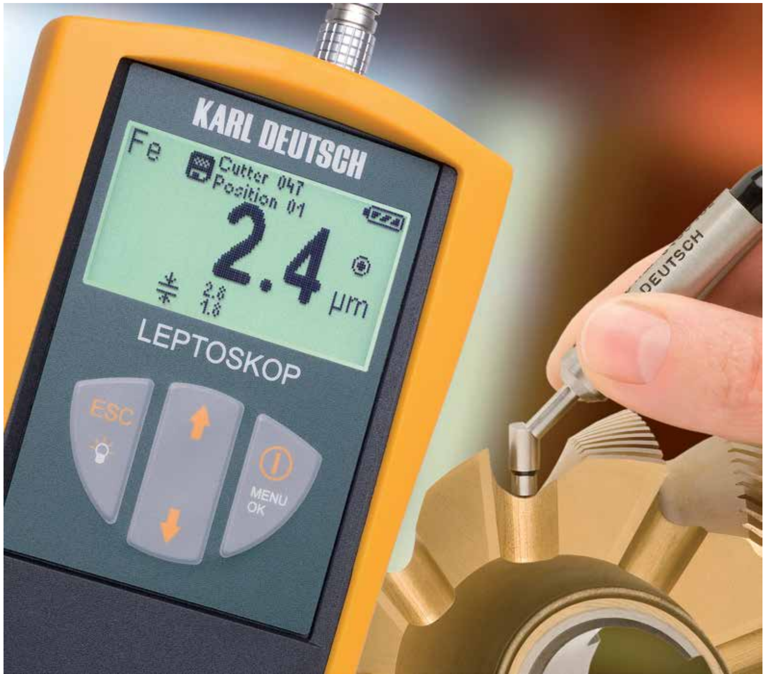
LEPTOSKOP® 2042 Coating Thickness Measurement