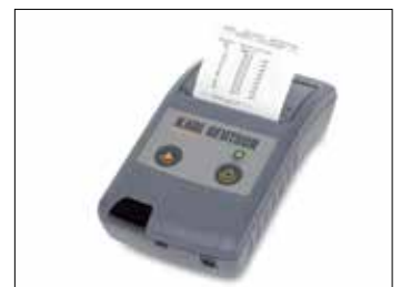
Mobile thermal printer