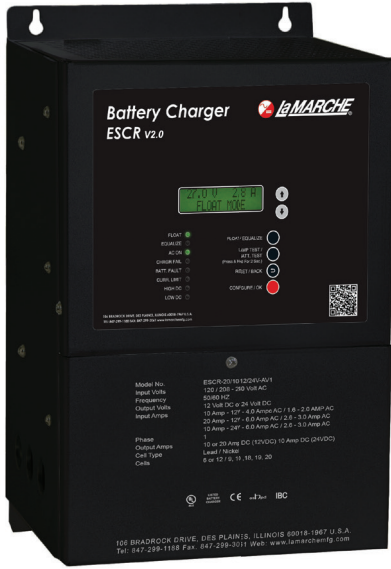
Unit Shown: ESCR-20/10-12/24V-AV1